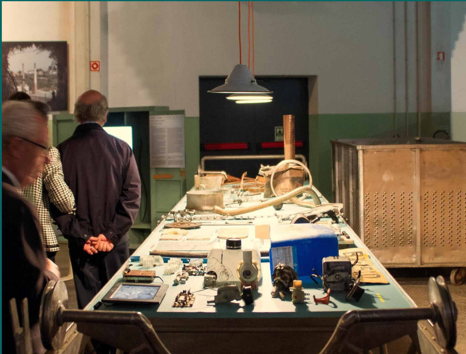
Post-Industrial Thinking Machine Engineering Museum, University of Porto